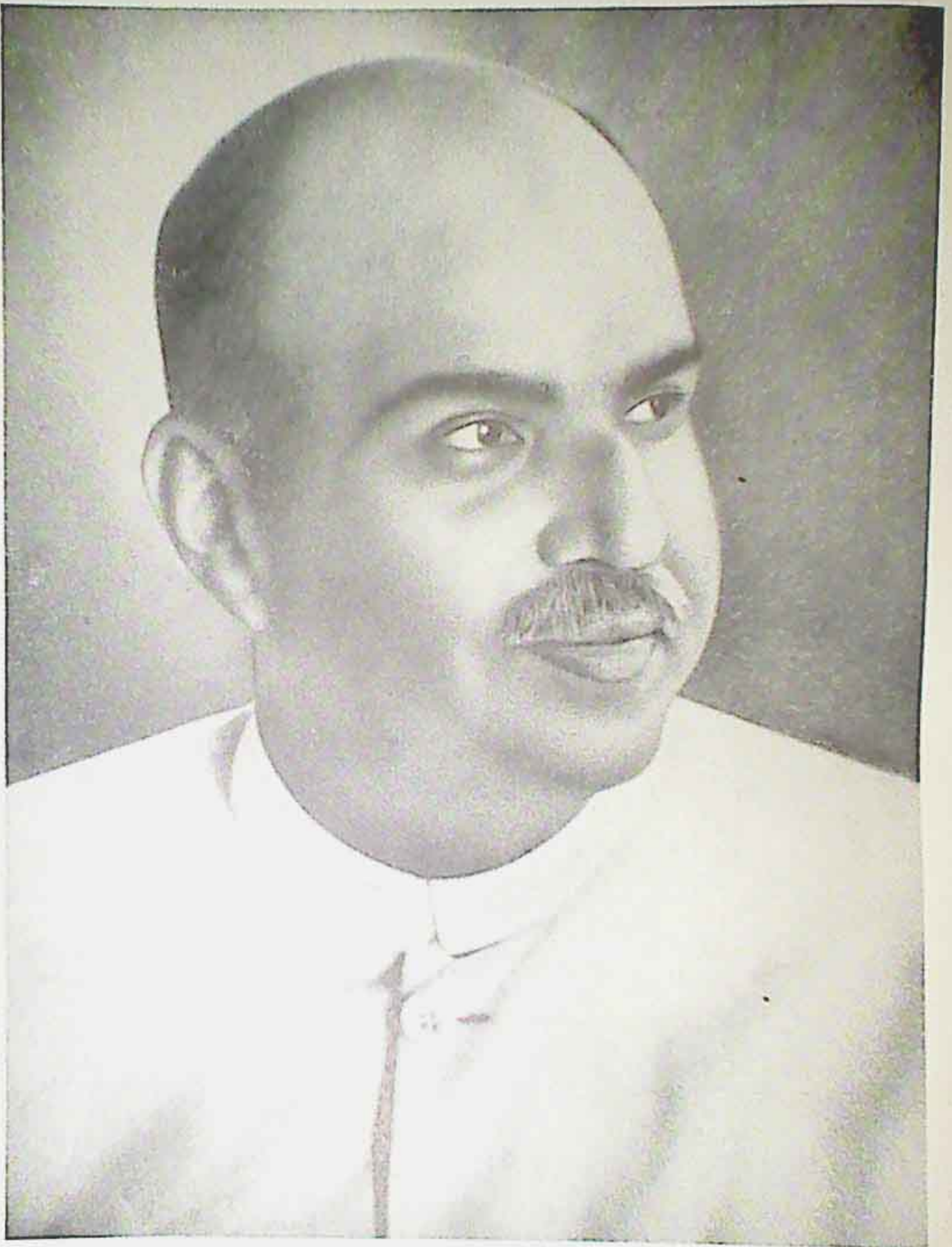
DR. SYAMAPRASAD MOOKERJEE President, Governing Body, 1924-1952